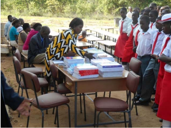
a capacity of 45 students.

In October of 2016 we began raising money to start adding one building at a time. By this time it was clear this was no longer a one congregation project. Local businesses, private donors around the country, and the Benton Harbor Sunrise Rotary Club joined the campaign. While we were raising money here, the community at Arnoldine were also working, rounding up bricks, quick sand, and cement to use in the building of each classroom block. A classroom block consists of two classrooms, each holding